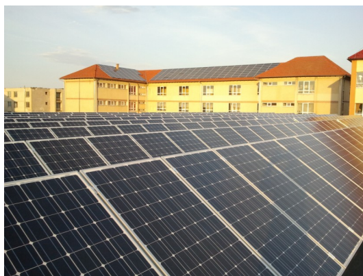
RES installation on several municipal buildings in Alba Iulia (PV solar)